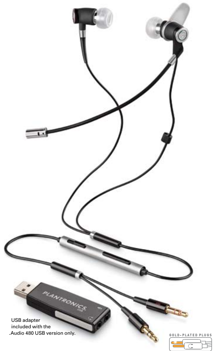
USB adapter included with the .Audio 480 USB version only.