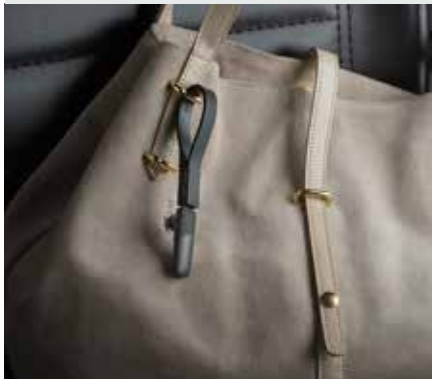
Dual-purpose USB strap