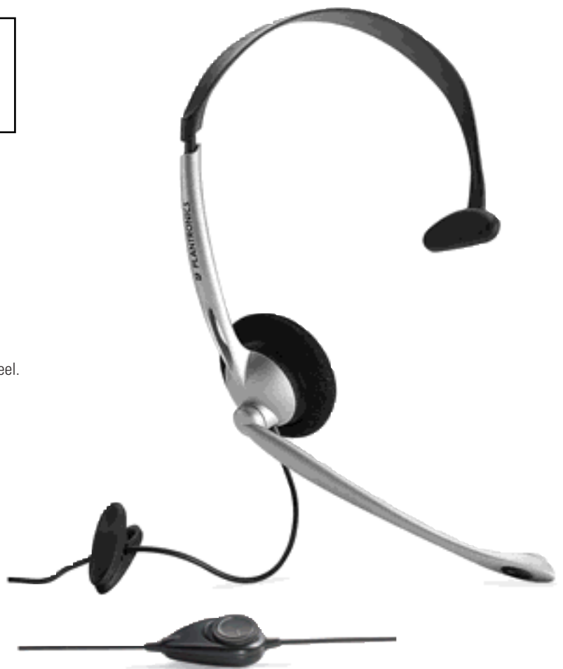
Convenient volume control (available on M114)