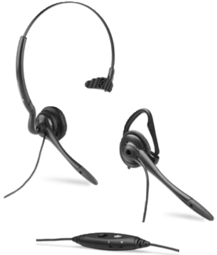
Easy volume and mute control (available on M175)